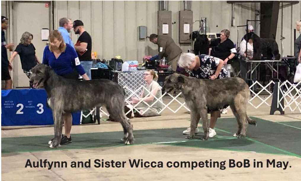
Aulfynn and Sister Wicca competing BoB in May.